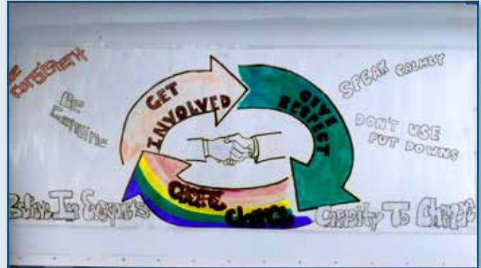
Artwork by some Turning Point Academy students.