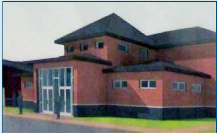
A rendition of the Future Foundations Academy.

The FFA building will also be home to ESCNJ’s Professional Development Academy. Two conference rooms with a 300-seat capacity will be used for PDA programs. The facility will also be available for business and greater community use. •