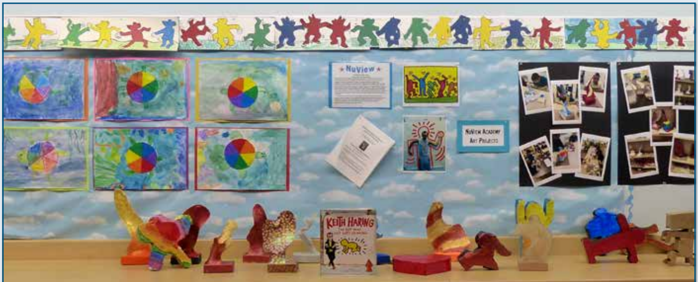
NuView Academy artwork.