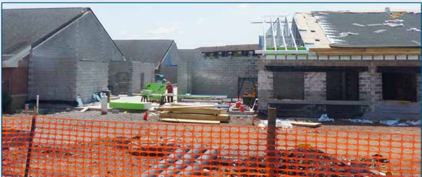
The FFA curriculum includes Community-based Instruction, robotics, computer coding and wellness instruction.