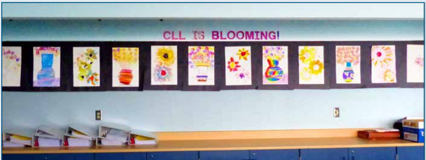
CLL and NuView Academy student artwork was on display recently in the Board Conference Room.