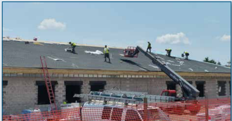
Two conference rooms with a 300-seat capacity will be part of the FFA.