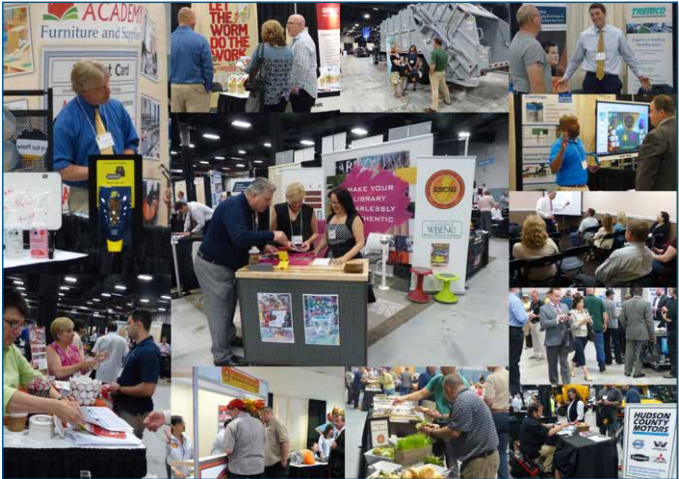
The Vendor Expo for ESCNJ's Co-op Pricing System members next year is May 15th.