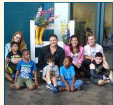
Students take a break during the Extended School Year program at BBLC.